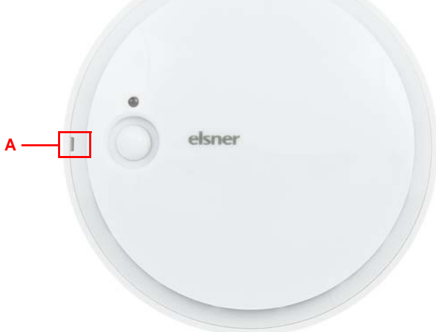
Fig. 1 A Recess to open the housing. When closing the housing, the recess aligns to the marking on the skirting